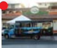
Hacienda Palma Real Nuevo Vallarta (Entrance to Jarretaderas)